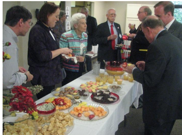
Members and friends enjoying the meet the artist reception following the concert