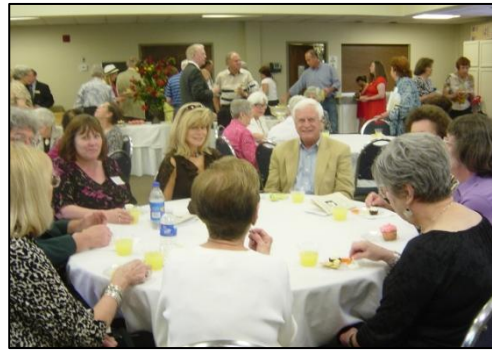
Members and guests enjoying meet the artist reception