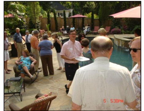
Members and guests enjoying the gathering