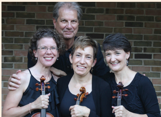
KAZANETTI STRING QUARTET