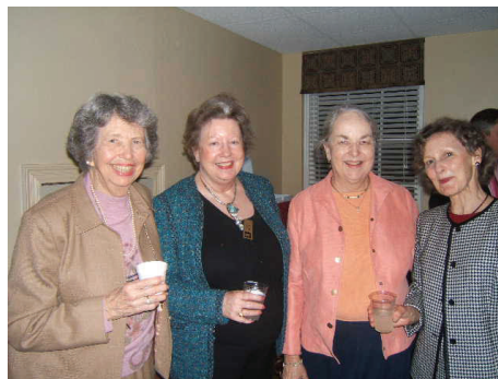
Members enjoy refreshments after last month's performance.