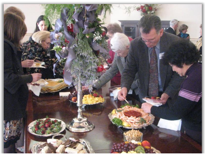
Members and Guests at Reception following the Scholarship Competition