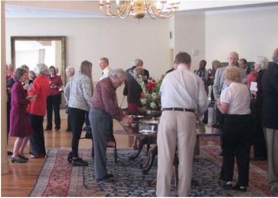
Members and Friends