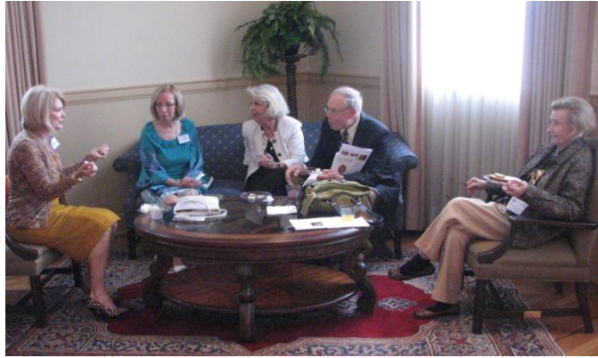
Members and Friends

Browse our Website at www.mozartatlanta.com to keep abreast of Pro-Mozart concerts and events.