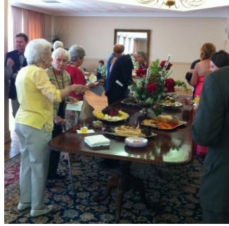
Members and Friends