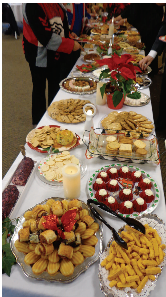
Members enjoy a delicious spread of festively presented hors d'oeuvres