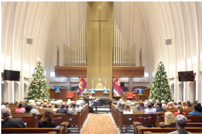
Our thanks to St. John UMC for allowing us to hold our concerts in their beautiful sanctuary.