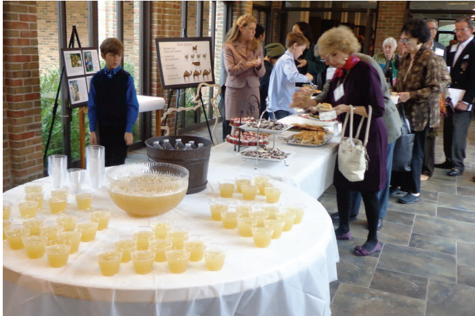
Members and guests enjoy socializing and delicious food at the "meet the artists" reception following the performance.