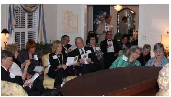
Pro-Mozart Patrons & Board Members readying for program